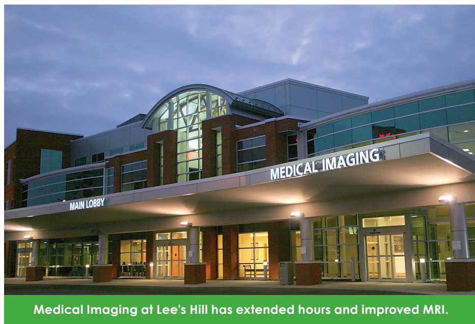
Medical Imaging at Lee's Hill has extended hours and improved MRI.