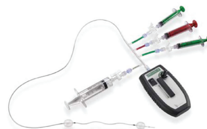
The Trellis Peripheral Infusion System for treating acute DVT.